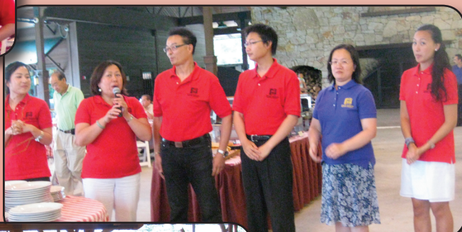
At the BBQ