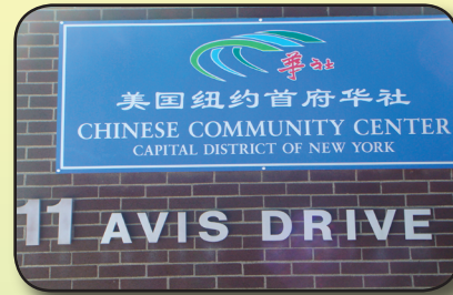
Albany Health Fair, Latham N.Y.