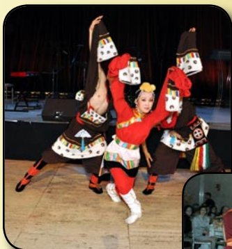
Dance of the Yak Dance of The Way of Five-Fire