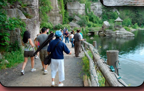
Hiking path to the top