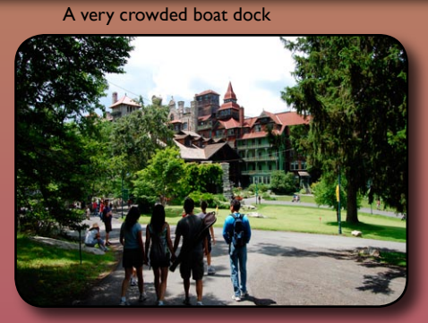
Walking towards the main house V Miniature golf