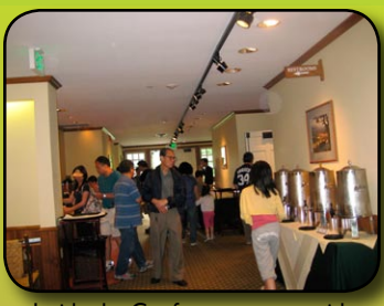
Inside the Conference room, with breakfast and all